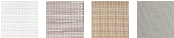
White Desert Sand Sandstone Dusk Grey